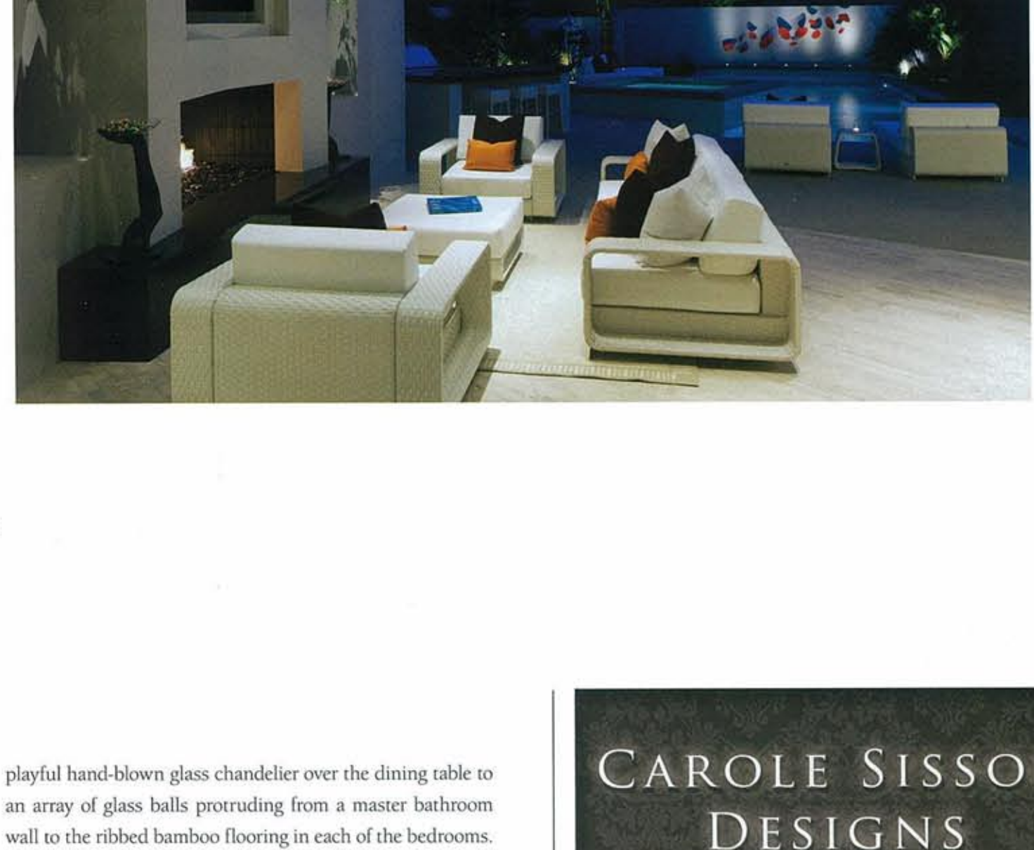
This page, from top: Travertine floors and fireplace bring style and comfort to the front patio of this house. | A front courtyard becomes a desert oasis when blessed with a 50-foot lap pool, spa, desert trees and flowers, and a view of Mount San Jacinto.