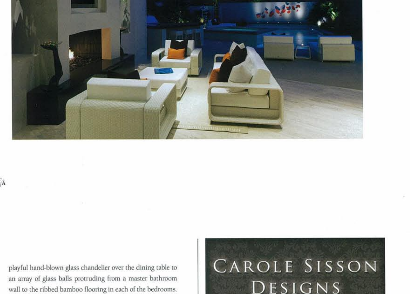
This page, from top: Travertine floors and fireplace bring style and comfort to the front patio of this house. | A front courtyard becomes a desert oasis when blessed with a 50-foot lap pool, spa, desert trees and flowers, and a view of Mount San Jacinto.